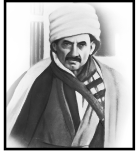
Nursi in Barla in 1926