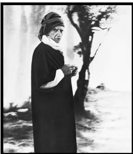
Nursi in the courtyard of Fatih Mosque in Istanbul in 1952