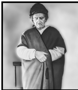
Nursi in his last days