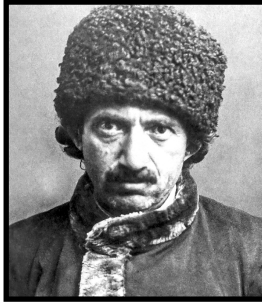
Nursi during The First World War