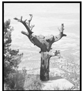
The Turpentine Tree near Barla. Nursi spent long nights on it to pray and supplicate.