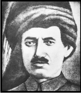
Nursi before The First World War