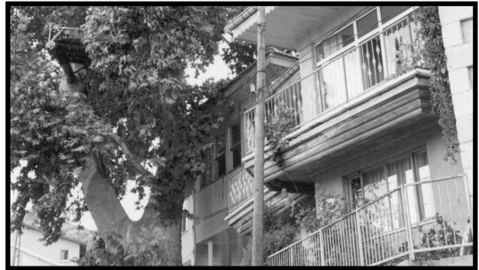
Nursi's Barla home where he wrote most of his Risale-i Nur Collection